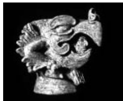
Painted modeled incense burner, Late Classic (A.D. 600-900), from Alta Verapaz, Guatemala