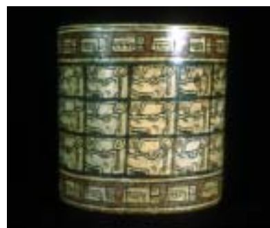
Painted ceramic figurine, Late Classic (A.D. 600-900), from Alta Verapaz, Guatemala (Coban region)