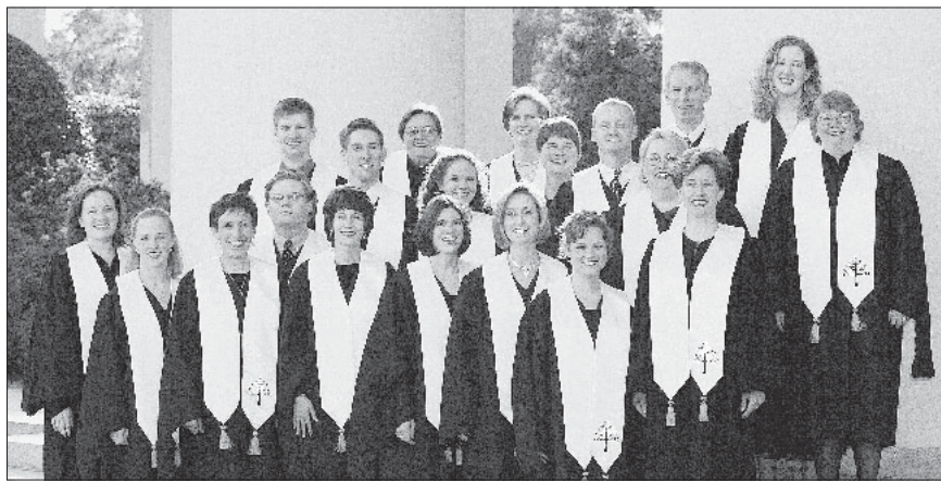
First WFU Divinity School Graduating Class