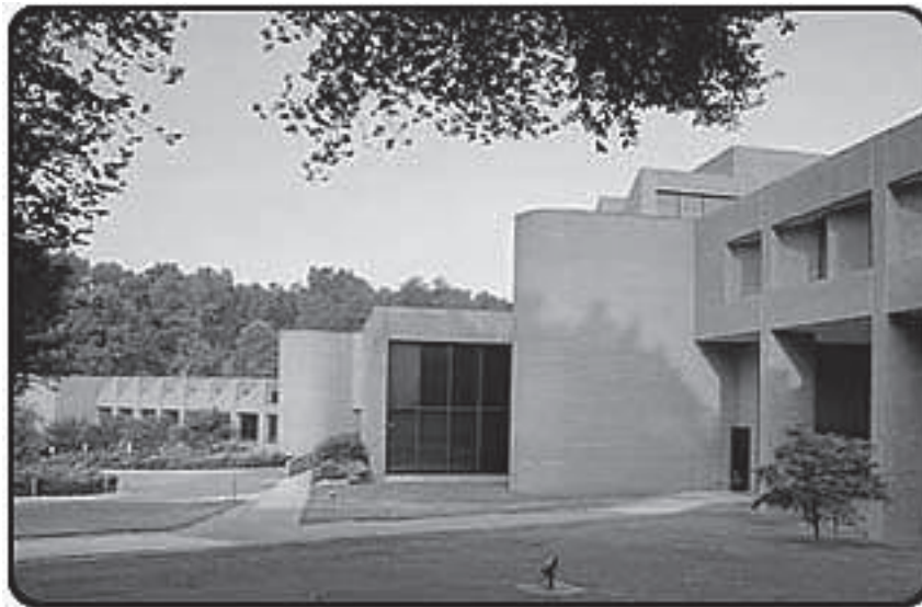
Scales Fine Arts Center