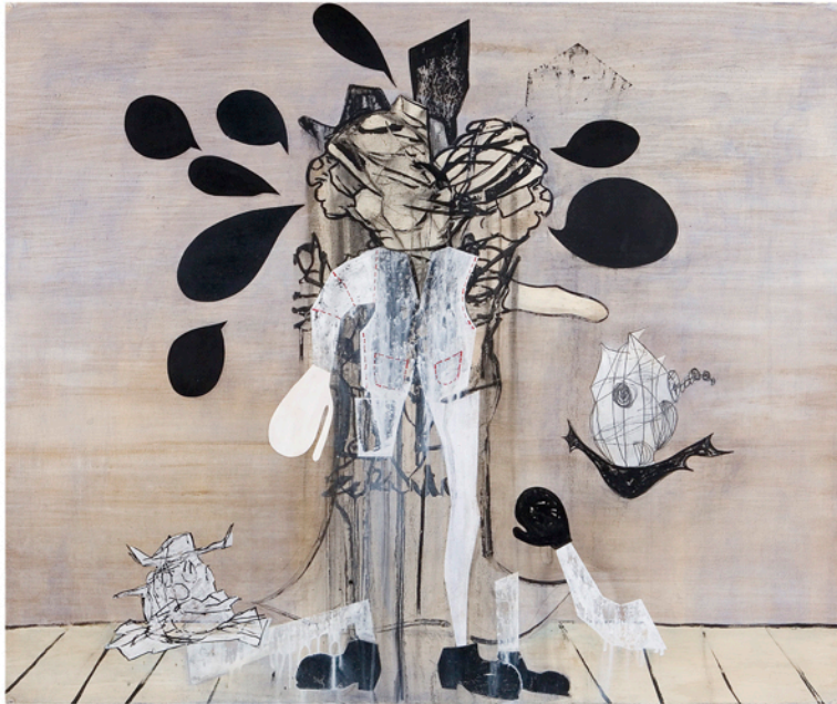
PROPHET – 2005, mixed-media collage on paper, 31.5" x 38"