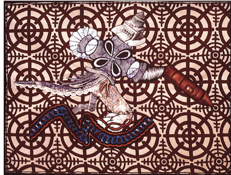
WAR DANDY – 2004, fabric, thread, webbing, 20" x 26"