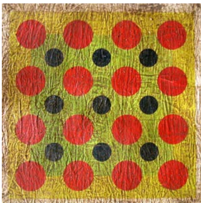
Document 2005 Beeswax, acrylic fortifying medium, soil, acrylic on canvas, suspended on steel (19" x 19")